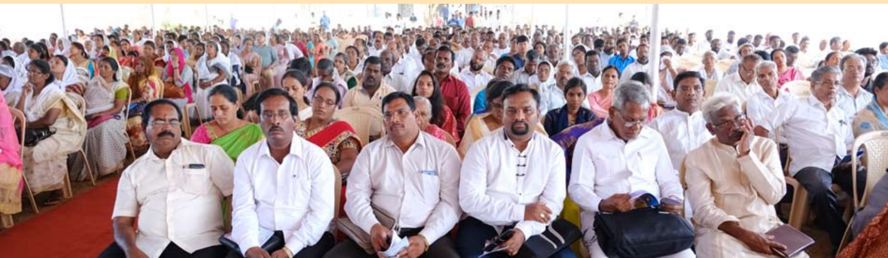
Family members and prayer partners at the service

This is the world’s cross. It is emblemized by vertical and horizontal beams, rusty spikes and Adamic blood dripping down splintery wood. I know because that day “the world was crucified to me, and I unto the world”. When theologians mention “the cross” it is often used as a metaphor. The real cross is made of burdens, fears and torments. The hammer that drove the nails is a forging of stress, disease, inflicted pain, toil, sweat and