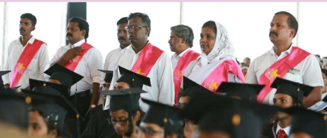
Evening class graduates